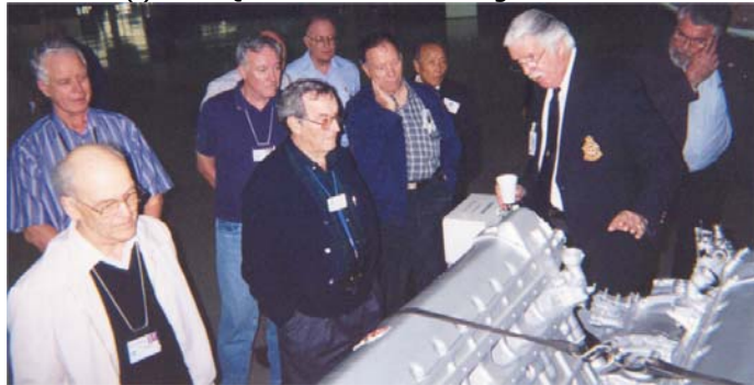
The tour of the Warplane heritage Museum and Mt Hope was very well attended. A group are shown here around one of Rolls Royce Merlin engines.