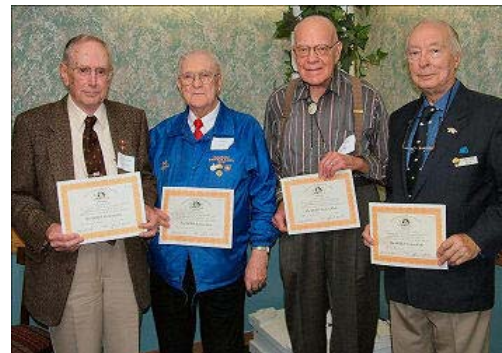
Century Club VE3EHM, VE3PJ, VE3AAH, VE3CDM

Not all of these amateurs were present but those who were are shown in these photographs.