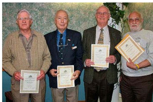
Certificates, VE3DUU, VE3CDM, VE3DHL, VE3FY